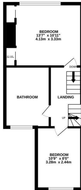
1ST FLOOR 371 sq.ft. (34.4 sq.m.) approx.